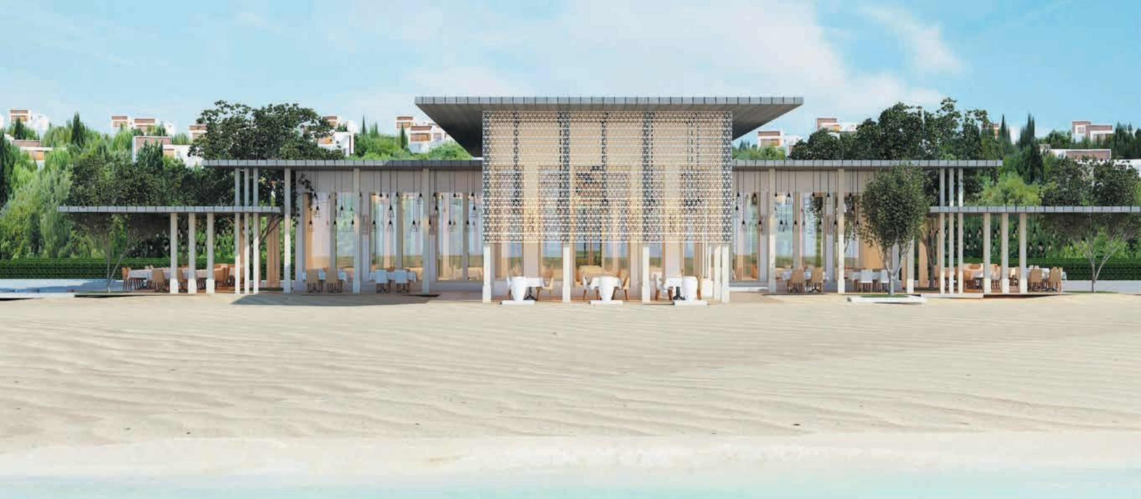
THE CLUB HOUSE