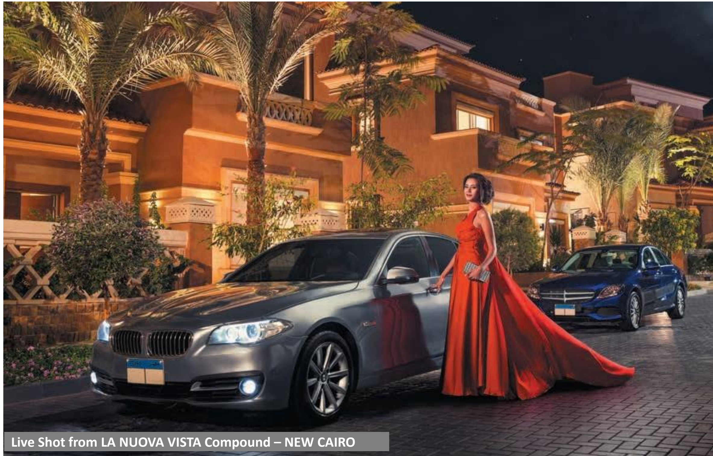
Live Shot from LA NUOVA VISTA Compound – NEW CAIRO